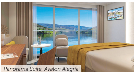
Panorama Suite, Avalon Alegria

*Prices include all taxes & port charges. Air and travel insurance are additional.